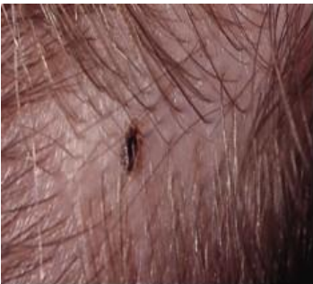
A head louse on a scalp.