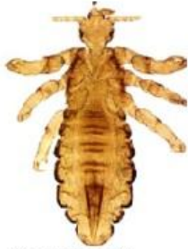
Head lice are 2 - 4 mm long.